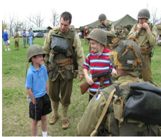
Living History Event, April 2013

An internship at the National D-Day Memorial Foundation exposes students to professional work experiences designed to guide them in making