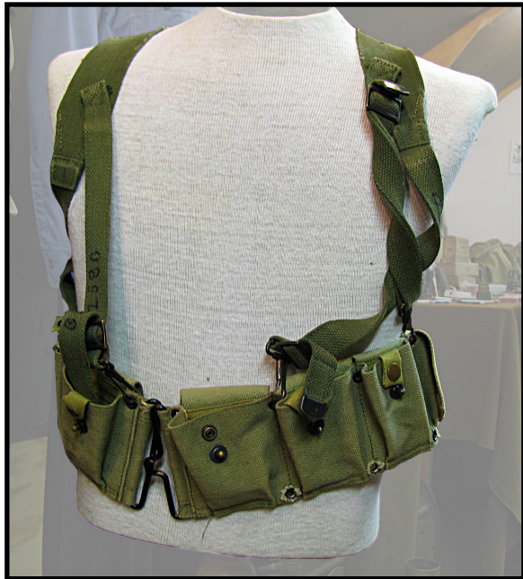
Strap Pack, Frontal View