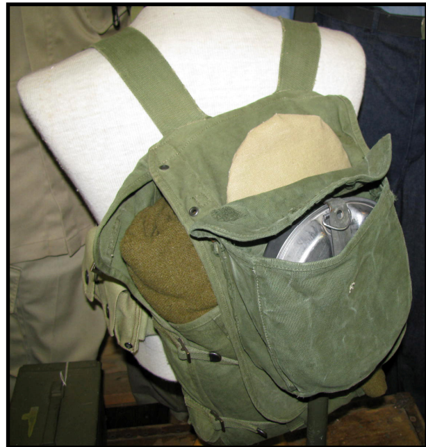
Strap Pack, Rear View, Close-Up