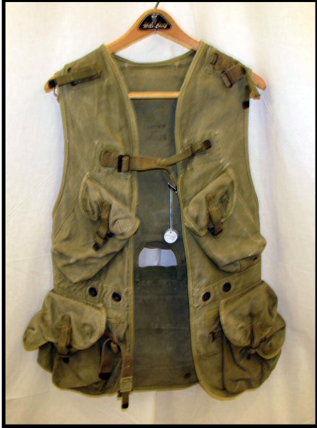
Assault Vest, Frontal View