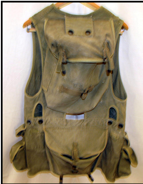
Assault Vest, Rear View