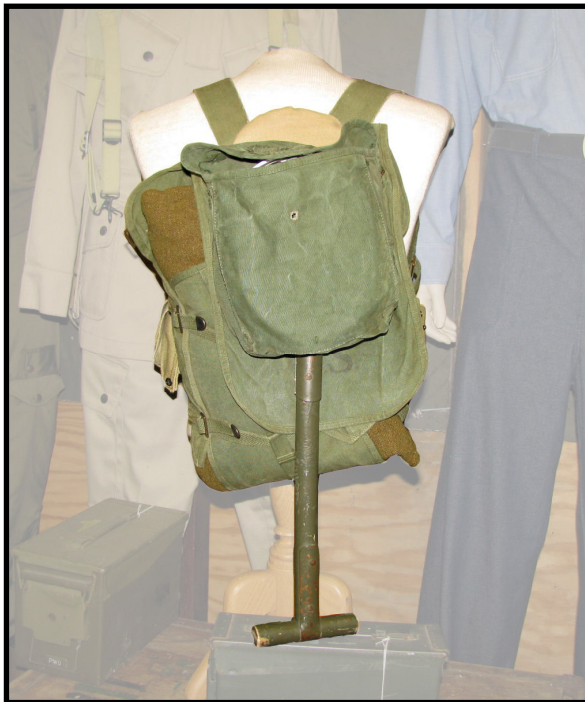
Strap Pack, Rear View