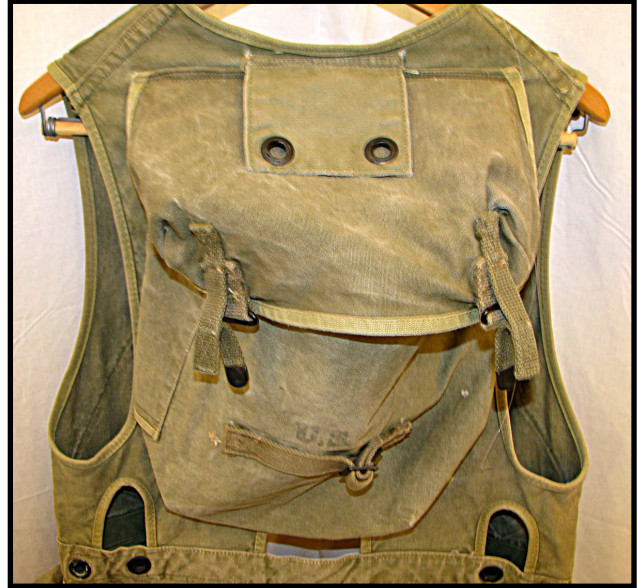
Assault Vest, Rear View, Top Half