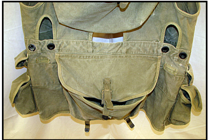
Assault Vest, Rear View, Bottom Half