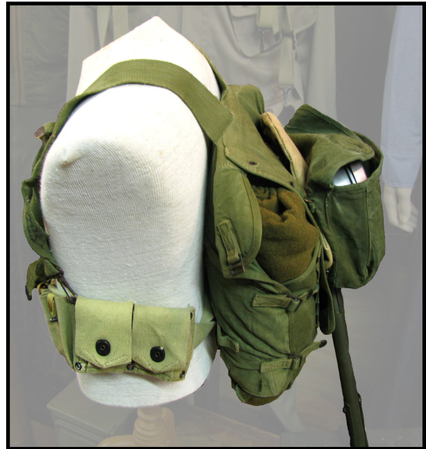
Strap Pack, Side View