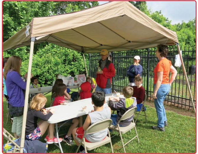
Students from Bedford Elementary School learning about the importance of soil for gardening in March 2016

This May, because of your continued support, more than 150 third graders will have the opportunity to learn how the war impacted the dinner table. In interactive sessions, they'll get to try their hand at wartime grocery shopping as we replicate a Piggly Wiggly. Armed with their allotted ration points and a couple of dollars, they plan their menu and “shop” for the food they need to feed their family. The importance of Victory Gardens soon becomes clear: the more food you could grow, the less you had to buy. The young green thumbs will also plant a class bed of vegetables and flowers, first receiving a valuable science lesson on the role of healthy soil.