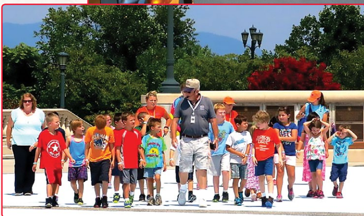
(top) Buses parked at the National D-Day Memorial for field trip programming