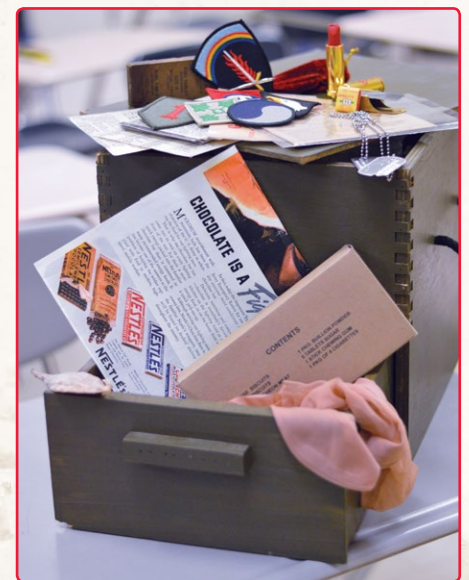
A closer look at artifacts from the Traveling Trunk as seen by students from Fauquier County Schools, Virginia in February 2017.

Because of your continued support, the Traveling Trunk program will provide over 1,700 students the opportunity to interactively learn about WWII and D-Day for the 2016-2017 school year; 1,700 eager learners who can’t come to our site. Thank you!