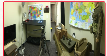
Our Virtual Studio prepared for Turning the Tide of WWII presentation.

Thanks to your generous support, the generous support of the Richard S. Reynolds Foundation, the Richard and Caroline T. Gwathmey Memorial Trust, the Virginia Fraternal Alliance, and our partnership with FieldTripZoom, virtual programs have increased the reach of the National D-Day Memorial. They also provide teachers an affordable and much appreciated way to supplement their World War II curriculum with an interactive and personal connection. Teachers, students, and more than a few home-school families have praised these online sessions. Thank you for making this possible!