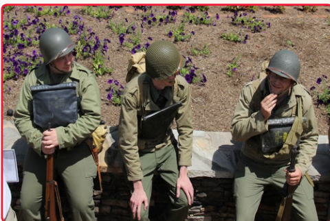
WWII reenactors take a break during our D-Day Commemoration.

“Best June 6th event ever!” several people told us afterward. But don’t worry—we’re working on how to top it next year!