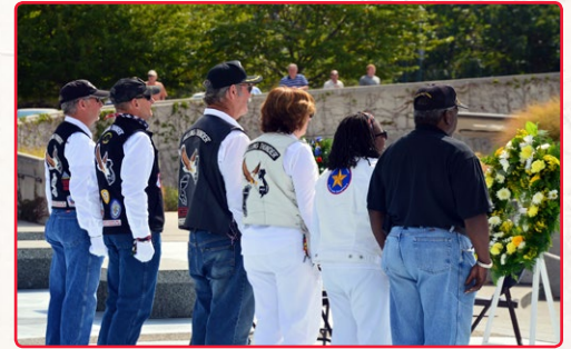
Rolling Thunder pays tribute during our 2016 POW/MIA Commemoration