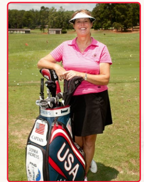
Former #1 world LPGA golfer, Donna Andrews